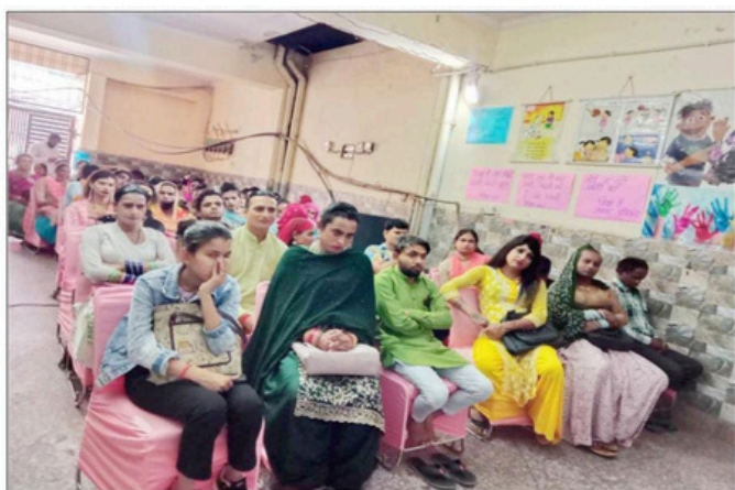
निपुण स्वयंसेवी संस्था ने दिल्ली स्टेट एड्स कंट्रोल सोसाएटी के सहयोग से चल रहे टार्गेट इंटरवेंशन प्रोजेक्ट के तहत ट्रांसजेंडर समुदाय के सशक्तिकरण पर सभा का आयोजन किया।